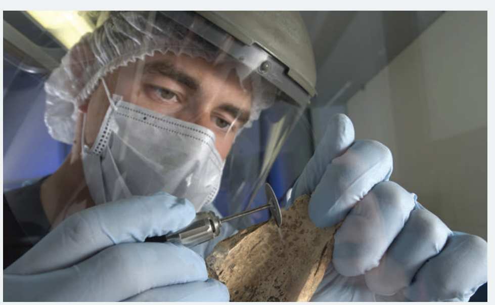
Neanderthal DNA Extraction. This sample of fossilized Neanderthal bone will have its genetic material extracted and sequenced as part of the Neanderthal Genome Project.

ice cores of Greenland revealed both the rapidity of climate change in the past and the crucial challenges encountered by plants and animals, including Homo sapiens and, before them, all hominins. Astronomical observations into the earth's varying orbital paths around the sun were additional and essential elements in charting the radical and rapid climate changes that have occurred over billions of